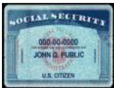
Social security card & picture ID

(2) legal document that proves right to work in the United States, such as the Deferred Action for Childhood Arrivals (DACA) and/or the documents below.